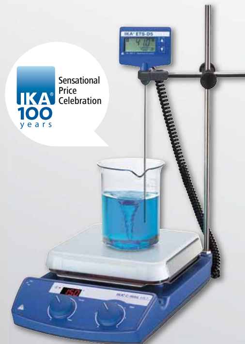
C-MAG HS 7 IKAMAG® Package