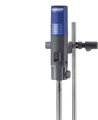
Package without stand and clamps